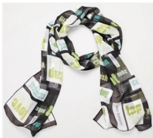
( http://blog.rachaelray.com/wp-content/uploads/2009/11/silk-scarf.jpg )

A Lot To Say Inc (http://shop.alottosav.com/) showed off t-shirts, bags and underwear emblazoned with sassy messages, and woven from recycled plastic bottles. The even use a water free printing process, keeping green by keeping our planet blue. I got one of these scarves that is made from 100% recycled plastic bottles and I wear it religiously! It feels like silk...no joke.