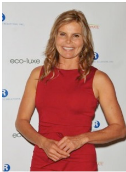
( http://blog.rachaelray.com/wp-content/uploads/2009/11/mariel-hemingway1.jpg )

Guests and press got to learn about cutting-edge and elegant green product from exhibitors such as Mercedes-Benz, IWC Schaffhausen, Alberto Parada Jewelry, Olivier New York, Moen, Audi, Bonterra Vineyards, Tesla, Dell, 360 Vodka, Jeeves of Belgravia, and Piaggio Vespa. And Mariel Hemingway (http://www.marielhemingway.com) was on hand to discuss Tatchme, as super-duper high-end eco-friendly skin care line complete with anti-aging power. It comes in hand-blown Murano glass jars. So pretty, and yet another example of how green product can be anything we want it to be. And that really should be everything!